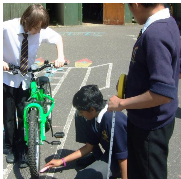
A science lesson using gears

Instructional Writing 'How to ride a bike'