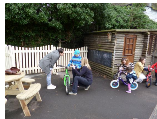
Parents teach children at the school how to ride with tips from our Instructors